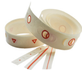
Indicator® Mammography Markers