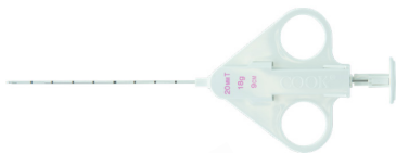
Quick-Core Semi-Automatic Biopsy Needle